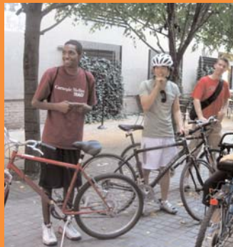
(Upper left): WQED-fm drew fans from Carnegie Mellon University eager to meet Marvin Hamlisch at the downtown studio. (Upper right): An interactive and engaging performance by the Gemini Theater at the Children's Museum.