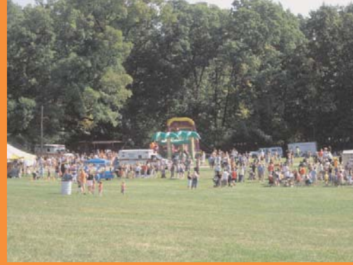
Hay Day at Allegheny County's Hartwood Acres (one of 15 RAD-funded regional parks) featured hay rides, a petting zoo, crafts and many other activities.