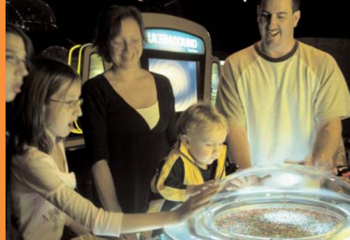
Amazing and exciting exhibits were discovered at the Carnegie Science Center.