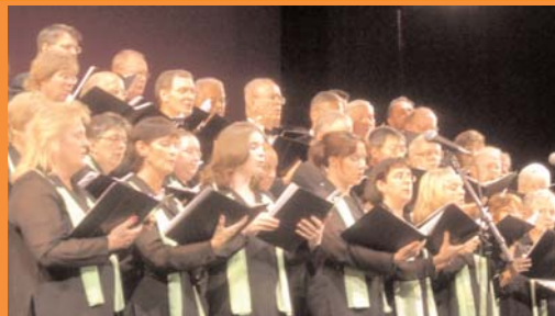
The South Hills Chorale performed a modern medley at the RADical Dance and Music evening at the Kelly-Strayhorn Theater.

To receive email notices about future RADical Days, send an email to jg@radworkshere.org and put RADical Days in the subject line.