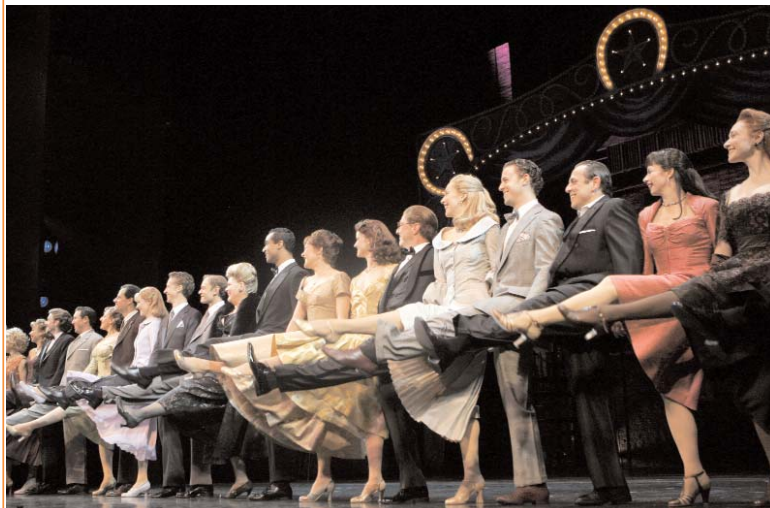
"Curtains" original Broadway cast; "Curtains" will be presented by the Pittsburgh CLO this summer from June 22-27 at the Benedum Center. The Pittsburgh CLO is a founding member of the Cultural District's Shared Services Initiative, utilizing the Tessitura joint ticketing system.

For more information about RAD's Connections Grant program, visit the District's web site.