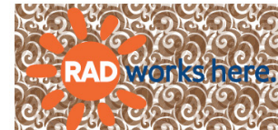
NEVER APPLY THE LOGO TO A BACKGROUND THAT DOES NOT PROVIDE SUFFICIENT CONTRAST.