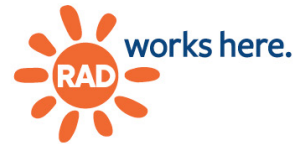
NEVER RE-ARRANGE THE ELEMENTS OF THE LOGO.

Please note these representations of misuses that must be avoided whenever applying the RAD logo. The logo must never be altered or recreated. Only use approved files received from RAD or at radworkshere.org/pages/grantee-toolkit